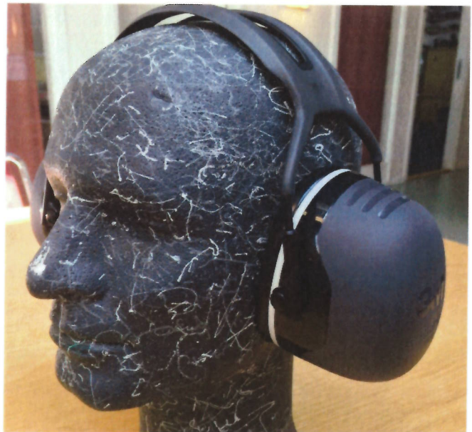
X5P5 - black