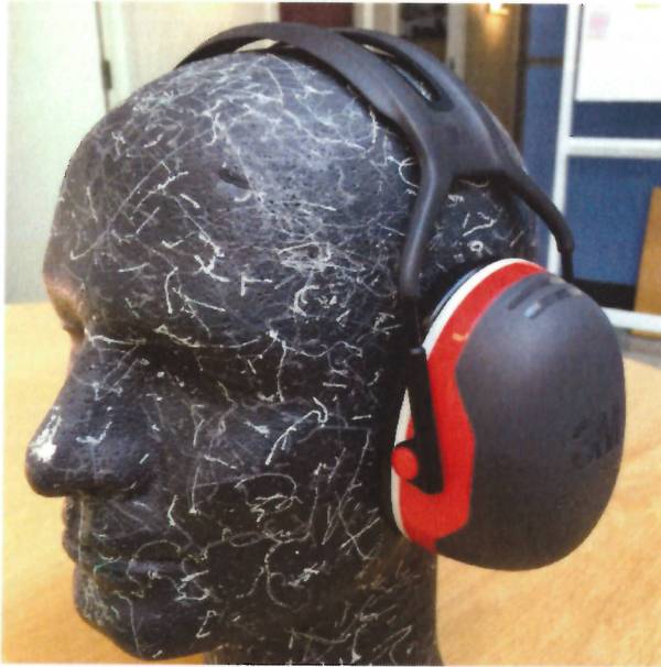
X3P5 - red