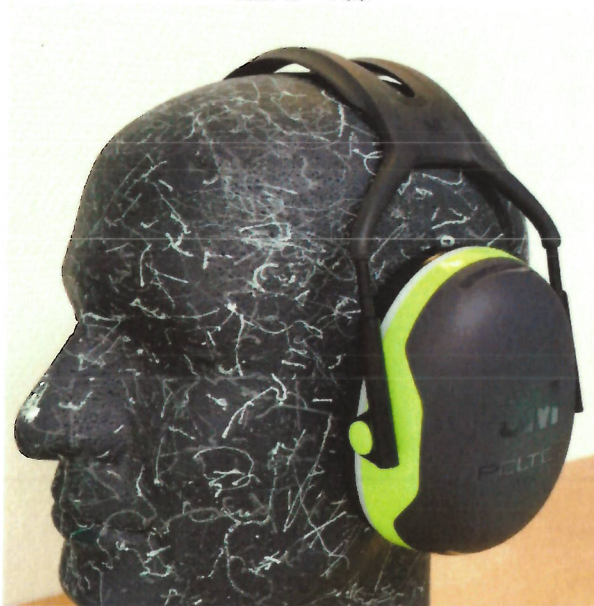
X4P5 - neon green