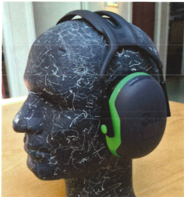
X1P5 - green

Pictures of the products on pages 2 and 3.