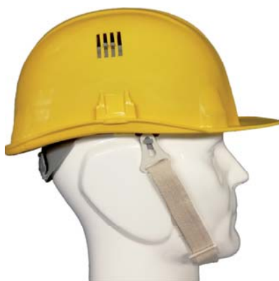
Ecrú cotton chinstrap 20 mm