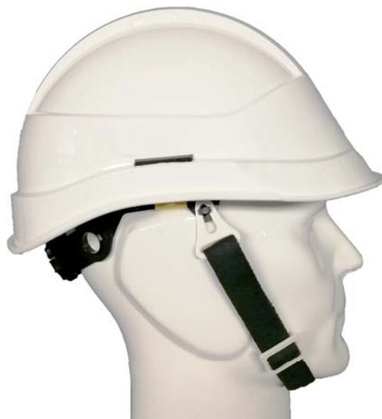
Black cotton chinstrap 20 mm