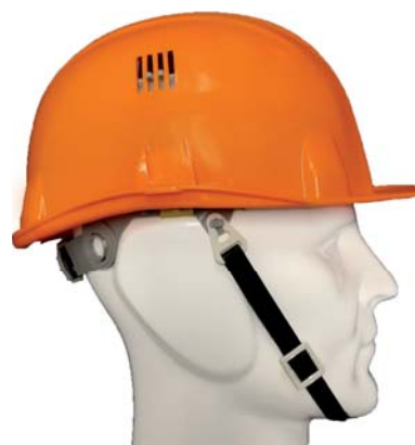
Black leather chinstrap 12 mm