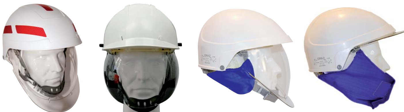
Grey 4 point chinstrap with chin cover for IDRA 2 helmet