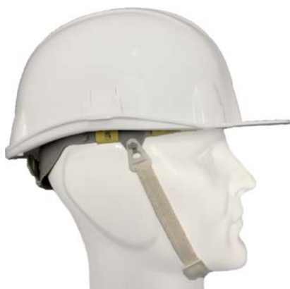
Ecrú cotton chinstrap 12 mm

Breaking anchor points according to NF EN 397 + A1: 2013.