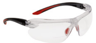
VERSIONS WITH READING AREA : +1.5 : IRIDPSI1,5 +2 : IRIDPSI2 +2.5 : IRIDPSI2,5 +3 : IRIDPSI3