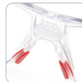
3 positions B FLEX nose