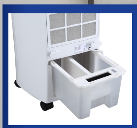
Removable Water tank with 6 l