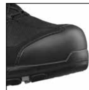
HAIX® Composite Toe Cap