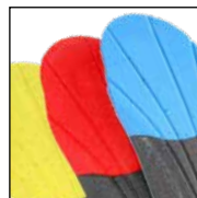
Vario Wide Fit System