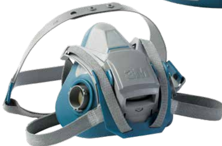
6500QL (Quick Latch) Series