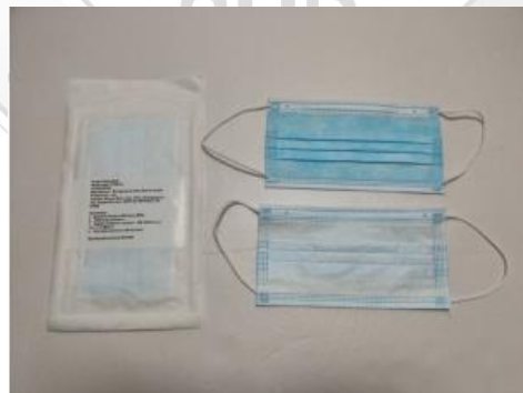
Photo of Samples

Note: Pass = Meet customer requirements; Fail = Fail customer requirements; # = No comment; N.D. = Not detected.