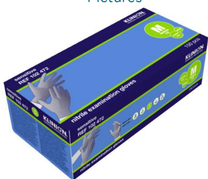
Ref. product 102472