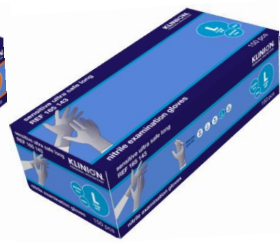
Ref. product 165143