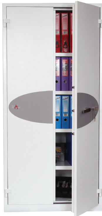
Fire Ranger FS1513K