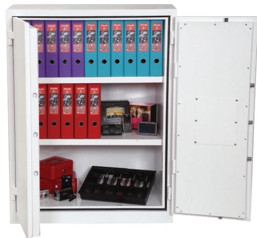
Fire Ranger FS1512K