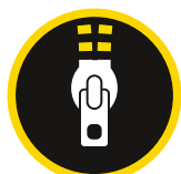
YKK MAIN ZIP LIFETIME WARRANTY