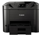
MAXIFY MB5450 series