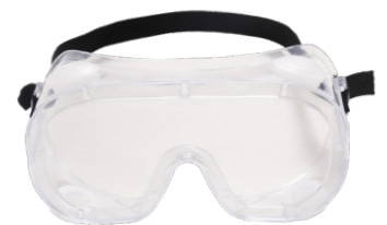
PSGG11209 (Indirect Vents)