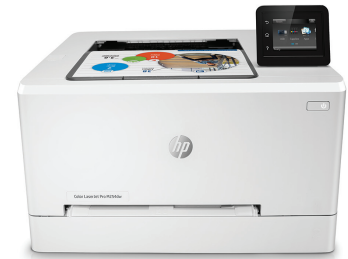
HP Color LaserJet Pro M254dw