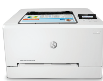
HP Color LaserJet Pro M254nw

Impress with colour and increase efficiency. Achieve fast print speeds, including the fastest in-class First Page Out Time (FPOT). 1,2 Count on intuitive security solutions, produce extraordinary colour prints, and get easy mobile printing. 3