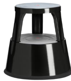
Colour: 6300-1 RAL 9005