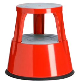
Colour: 6300-4 RAL 3020