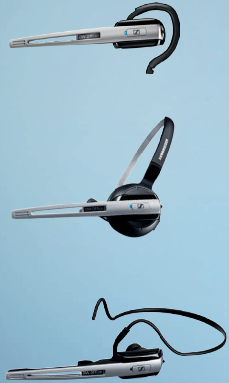
Note: Neckband available as accessory