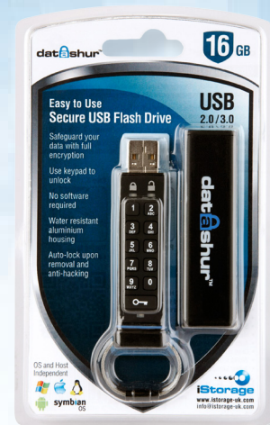
datAshur in retail packaging