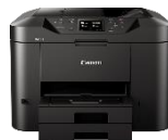
MAXIFY MB5150 series