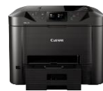
MAXIFY MB5450 series