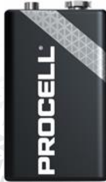
size: 9V (6LR61) PC1604