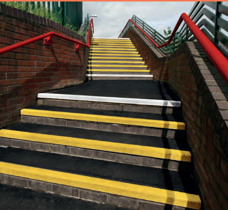
COBAGRIP Stair Tread