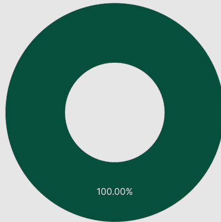
● Sourcing of raw material (bleached kraft paper)