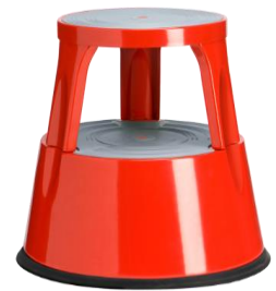
Colour: 6300-4 RAL 3020