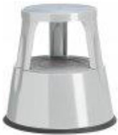
Colour: 6300-9 RAL 7035