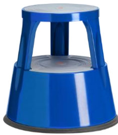
Colour: 6300-5 RAL 5005