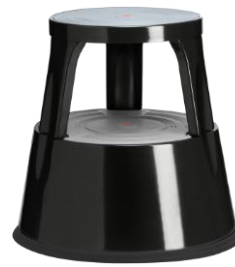
Colour: 6300-1 RAL 9005