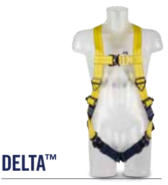
Front & rear fall arrest attachment points. Quick connect buckles.