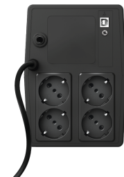
PRODUCT BACK 1