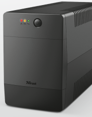
PRODUCT PICTORIAL 1