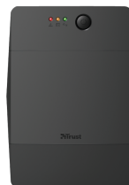
PRODUCT FRONT 1