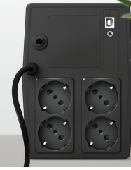
PRODUCT PICTORIAL 2

4 Battery and surge protected wall power outlets