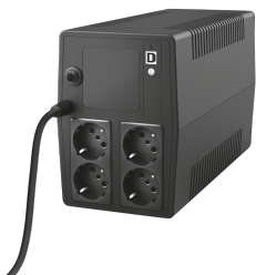
PRODUCT VISUAL 2