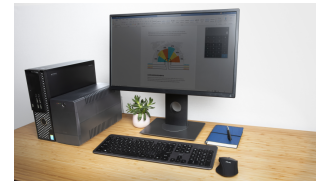
LIFESTYLE VISUAL 1