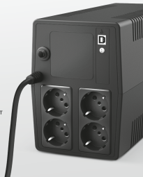
PRODUCT PICTORIAL 3