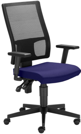
TAKTIK MESH TS25 R19T ERGON2L