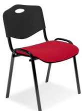
ISO MIX BLACK