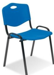
ISO PLASTIC BLACK