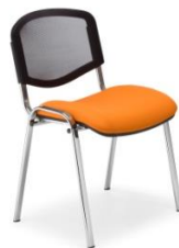
ISO ERGO MESH