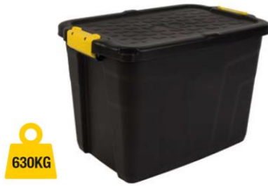
60cm Length x 40cm Width x 40cm Height