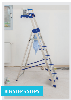
BIG STEP 5 STEPS

STABLE thanks to the large non-slip feet.