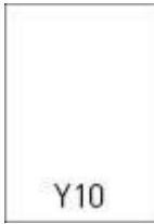
Y10 140 x 204 mm