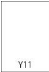
Y11 165 x 240 mm