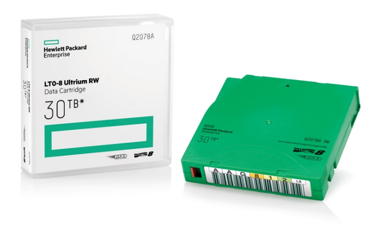
HPE LTO Ultrium Storage Supplies

Backed by this uncompromising media qualification process, HPE LTO Ultrium data cartridges support all HPE StoreEver and non HPE LTO Ultrium tape devices. The latest eighth generation products minimize interruption to network and SAN backup by being capable of protecting 1.30 TB/hour of data at native speeds and storing up to 12 TB native (30 TB assuming 2.5:1 compression) on one piece of media (480% greater capacity than HPE LTO-6 Ultrium tapes and 1000% greater than LTO-5).