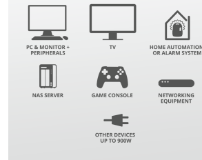
PRODUCT PICTORIAL 5