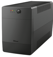
PRODUCT VISUAL 1