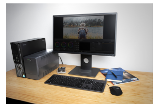
LIFESTYLE VISUAL 1