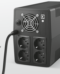
PRODUCT PICTORIAL 3