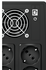
PRODUCT PICTORIAL 4