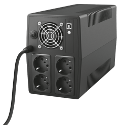
PRODUCT VISUAL 2