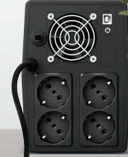
PRODUCT PICTORIAL 2

4 Battery and surge protected wall power outlets