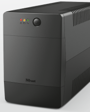
PRODUCT PICTORIAL 1