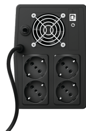
PRODUCT BACK 1