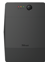
PRODUCT FRONT 1