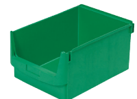
Link Bin with Peg 2001