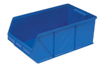
Maxi Storage Bin 1