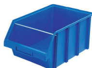
Storage Bin with Rail 4000