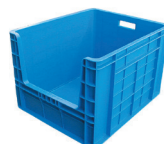
Logistic Container 95