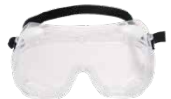
PSGG11209 (Indirect Vents)